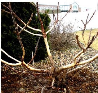
Unprotected shrub damaged by rabbits.

We recommend newly planted trees be wrapped with a white protective tree wrap late in the fall to help protect against sun scald and rodent and rabbit damage during winter. Remove wrap in the spring. This practice should be continued every year until the bark begins to roughen. The wrap should extend from the ground up to the first tier of branches. Fiber reinforced tape works best to hold up the wrap.