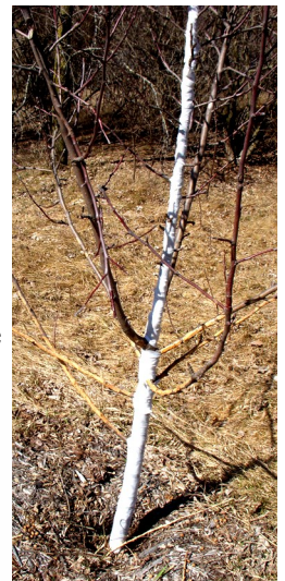
A well-wrapped and well-mulched tree.

281 Saint Andrews Drive Mankato MN 56001 507-388-4877 www.drummersgardencenter.com