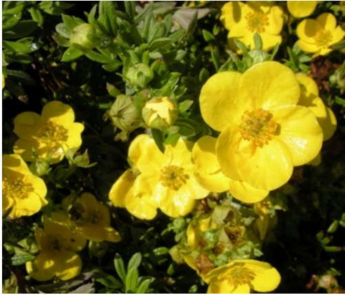
Potentilla blossoms wet with dew.