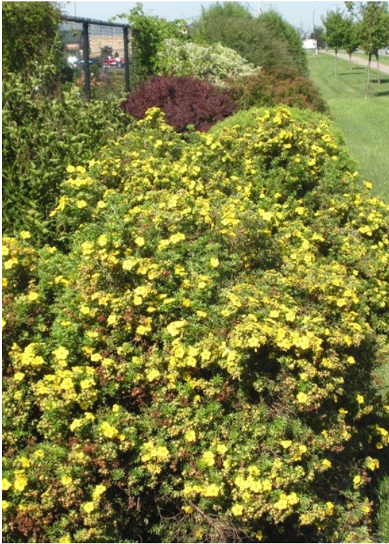
Potentilla in front of the shrub border blooms all summer long.